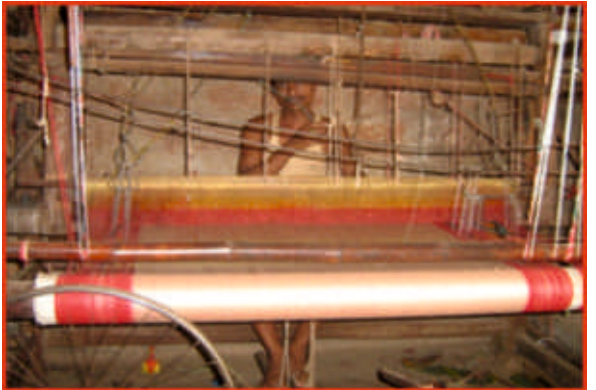
Bata Patra Engaged in weaving